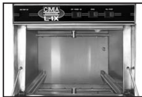
Upper and lower rotating wash arms guarantee excellent results.