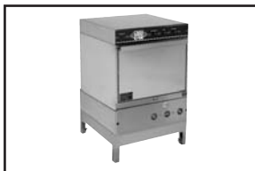
Optional pedestal allows the L-1X to be raised up to a full 12" off the floor for easy operator use. Height adjustable from 8" to 12".