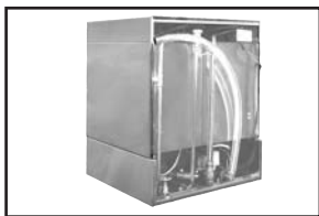
Pumped drain will drain uphill. Requires no floor drain.