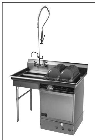
Optional dishtable, faucet and pre-rinse unit sold separately.