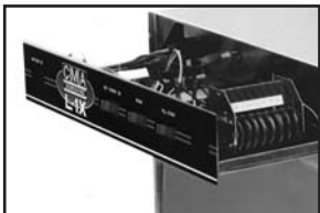
"Works-in-a-drawer", may be removed by disconnecting wires from terminal block.